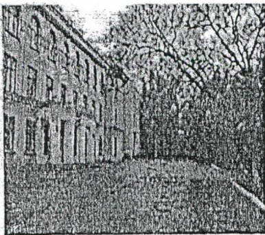
Lyceum Titu Maiorescu